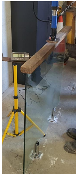
Uniformly Distributed Load (Vertical)