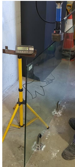
Concentrated Load (Downwards)

Requirements No Breakage, fracture or loosening of any part.