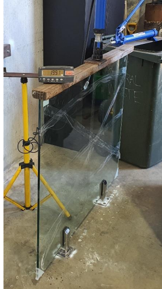
Uniformly Distributed Load (Vertical)

Requirements No Breakage, fracture or loosening of any part.