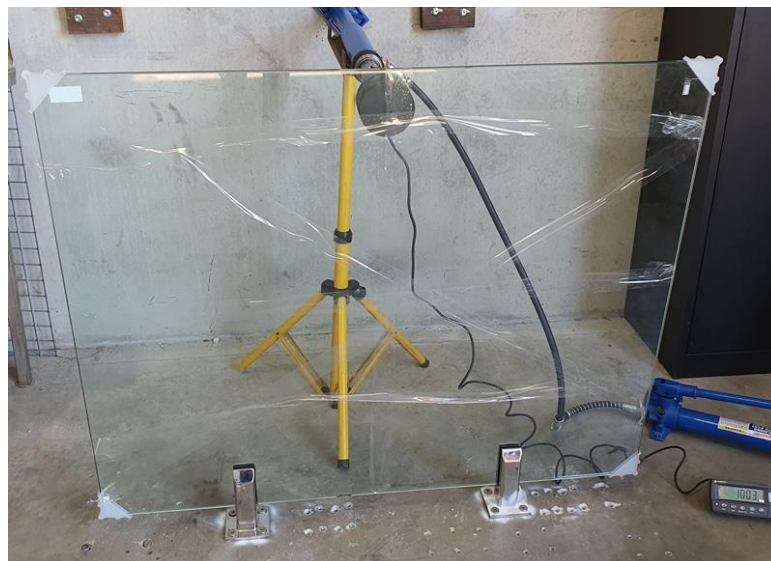
Concentrated Load (Outwards)