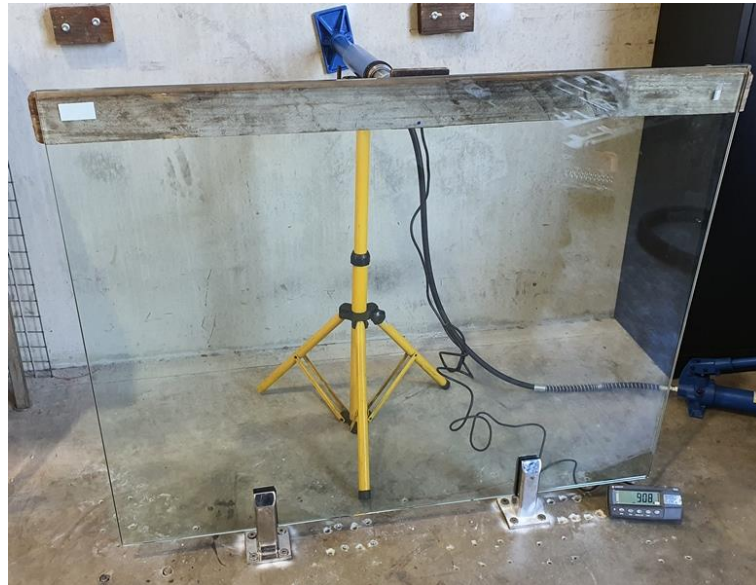
Uniformly Distributed Load (Horizontal)